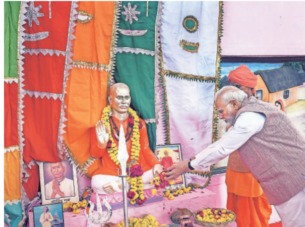
Prime Minister Narendra Modi pays homage to Bhil freedom fighter Govind Guru in Banswara on Tuesday.

Addressing a largely tribal gathering in Jambughoda, Modi said that tribals had suffered for decades due to the "discriminatory" mindset of previous governments. Modi said, "You know what was the condition of tribal areas 20-22 years ago... Children wanting to go to school from tribal areas had no choice, no transportation, no food, and no nutrition... Today you see, lakhs of tribals have benefitted from the schemes. This did not