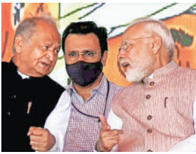
PM Narendra Modi interacts with Rajasthan CM Ashok Gehlot in Banswara.

He added that India is "correcting the mistake" of excluding the contributions of tribals from the history of the country's freedom struggle.